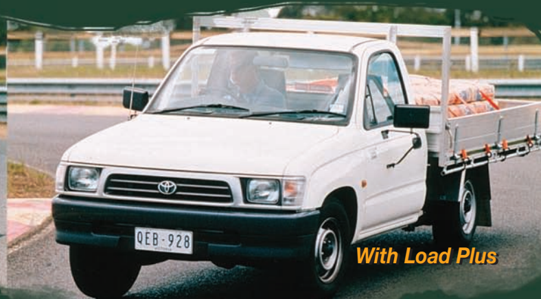
With Load Plus