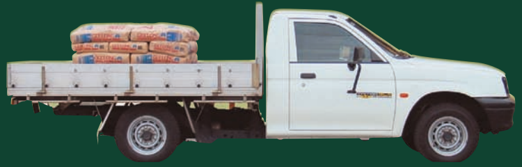
With Load Plus