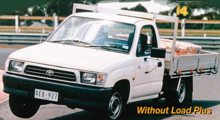
Without Load Plus

Drives like a car... carries like a truck!