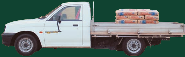
Without Load Plus

Designed for SUV's, 4x4's Pickups and Vans